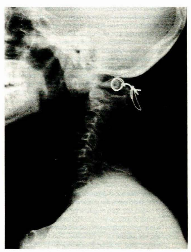
Fig. 4. Case 2. Radiograph showing C1 and C2 fused in a subluxed position 6 months after operation.

Kyphosis in tuberculosis of the cervical spine tends to be more severe, as the only natural support is the point at which the chin touches the sternum. This kyphosis together with atlanto-axial subluxation in C1/C2 involvement increases the chances of neurological involvement in tuberculosis of the cervical spine.