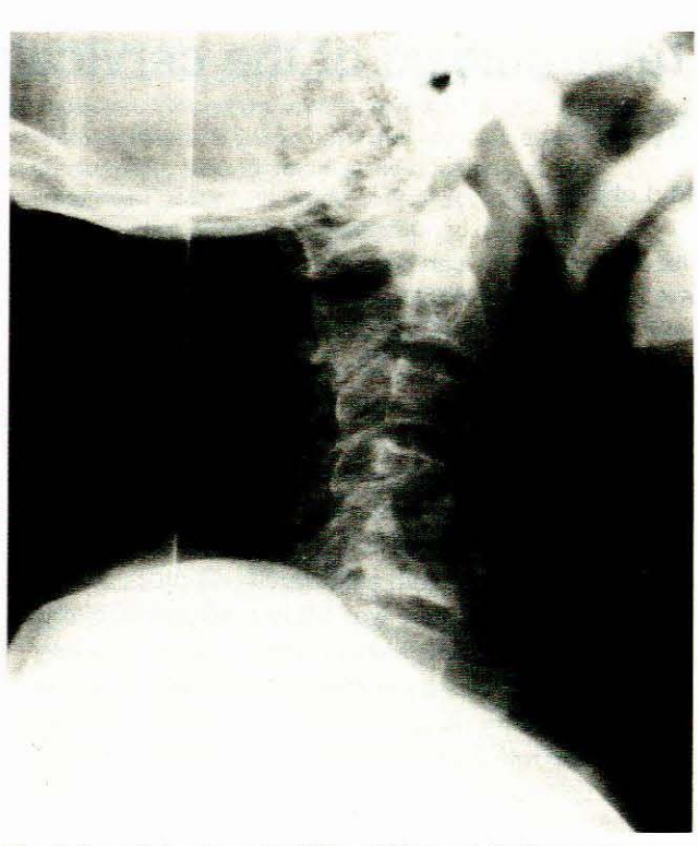
Fig. 2. Case 4. Involvment of C5 and C6. In adults few motion segments are involved.

was treated with a SOMI brace. The other patient had a positive lymph node biopsy and tetraparesis but was too ill to undergo surgery. He had halo traction for 6 weeks followed by immobilisation in a Minerva jacket for a further 6 weeks