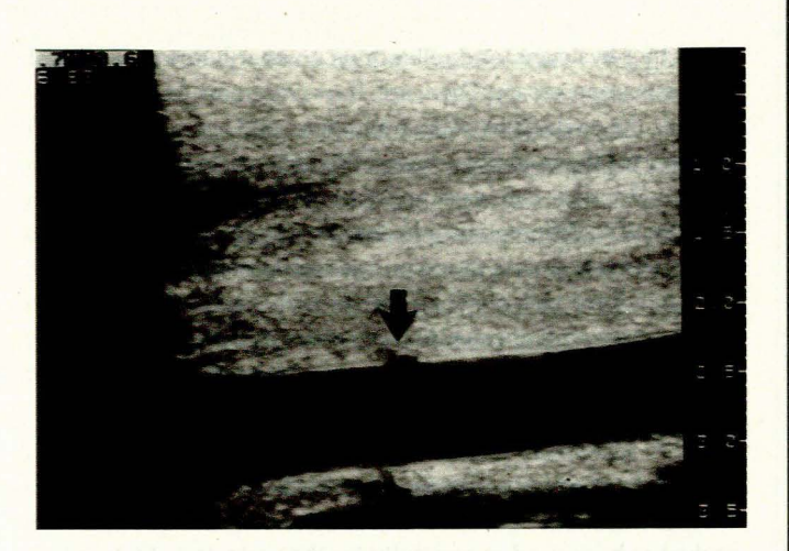
Fig. 1. Intimal laceration of the common carotid artery (arrow) missed on the angiogram.

This prospective study demonstrates the sensitivity of colourflow ultrasound as a screening investigation to detect vascular injuries following penetrating neck trauma. In our study