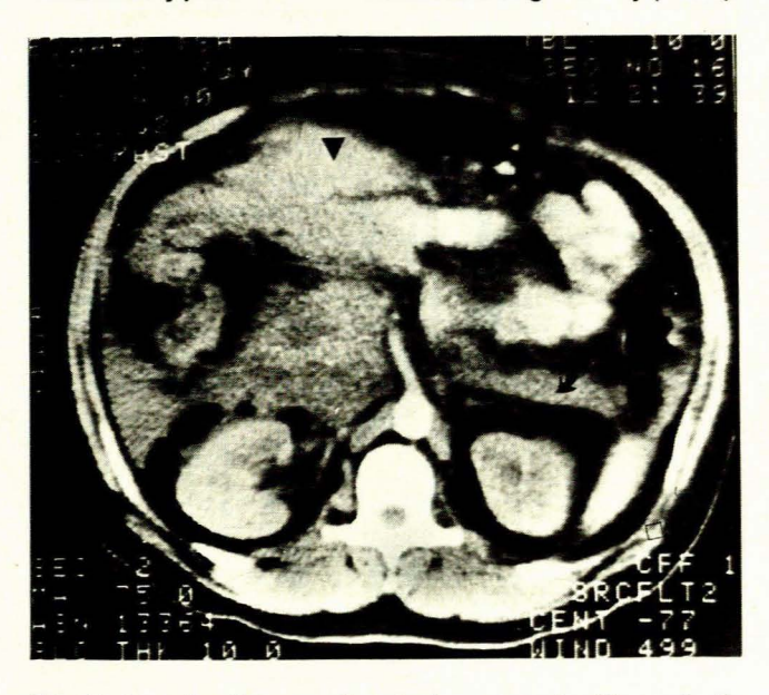
Fig. 2. Low-density area (head of pancreas) with markedly heterogeneous blush after bolus of contrast medium. There are inflammatory changes in the left anterior pararenal space (arrow) and an irregular area of high density anterior to head of pancreas (arrowhead). There is no change in the density of the mass compared with pre-contrast scans.

Fig. 1. Large low-density mass (0-6 HU) in area of head of pancreas. There is penetration of Gerota's fascia by the inflammatory process with extension to the right kidney (arrow).