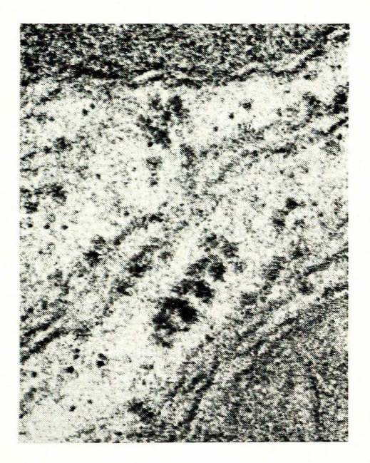
Fig. 5. Enlarged view of one of the helical polysomes seen in Fig. 4 (× 150 000).

mitochondria were small with a dense matrix and normal granules. The cytoplasmic matrix mostly contained single ribosomes, and the rather infrequent polysomes present were exclusively of the helical type (Figs 4 and 5). In the plane of section one could usually count 6 - 8 ribosomes in the structure.