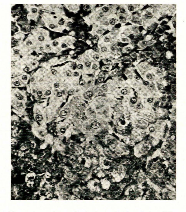
Fig. 1. Early hyperplastic focus (PAS stain × 400).