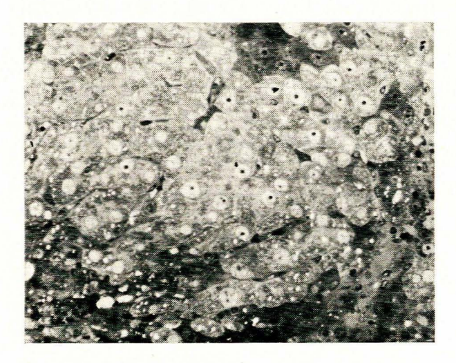
Fig. 2. Early hyperplastic focus. Epon-embedded section (toluidine blue \times 300).