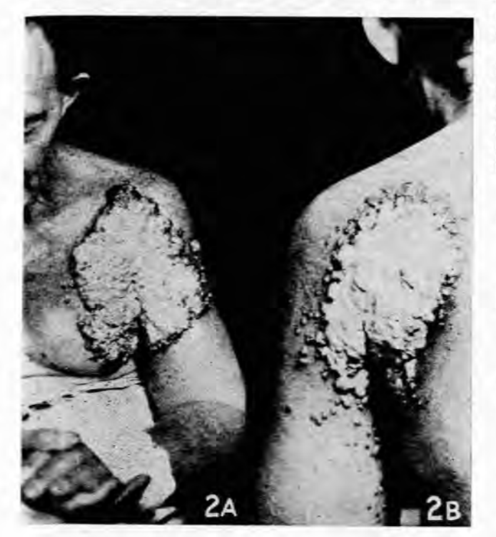
Fig. Metastatic cutaneous melanomatosis confined to 2 two irradiated axillary skin fields. There is obviously a resistance-factor operating in the unaffected skin.

rash. The skin rash faded within a few days, except for those lesions inside the irradiated areas which persisted and increased. Some weeks later each macule within the irradiated skin-fields