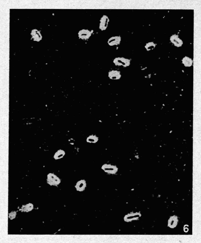
Fig. 6. Klebsiella rhinoscleromatis. Indian-ink preparation. The plate shows the encapsulated organisms.

cubation at 37^{\circ} C), rhamnose, laevulose, dextrin, arabinose, glycogen and glycerol (after 10 days of incubation). Lactose and dulcite were not fermented. The H<sub>2</sub>S, indol, urea citrate and Voges-Proskauer tests were negative.