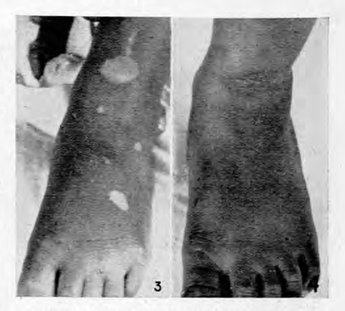
Fig. 3. Case 6 before treatment. Fig. 4. Case 6 after 2 weeks' treatment.

It will be seen, therefore, that some of the cases described as failures have hardly given the treatment a fair trial, while two or three of the more recently treated cases have not been under observation long enough to be regarded as outright failures although