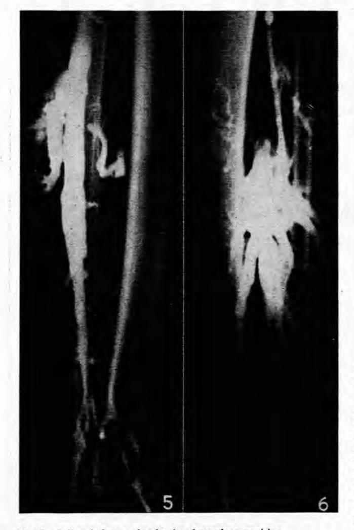
Fig. 5. Dilated deep veins in the dependent position. Fig. 6. Dilated deep veins with a light tourniquet applied to the thigh.

Certain features about valves in veins must also be considered, as the whole concept of a pump and the propulsion of venous blood towards the heart depends