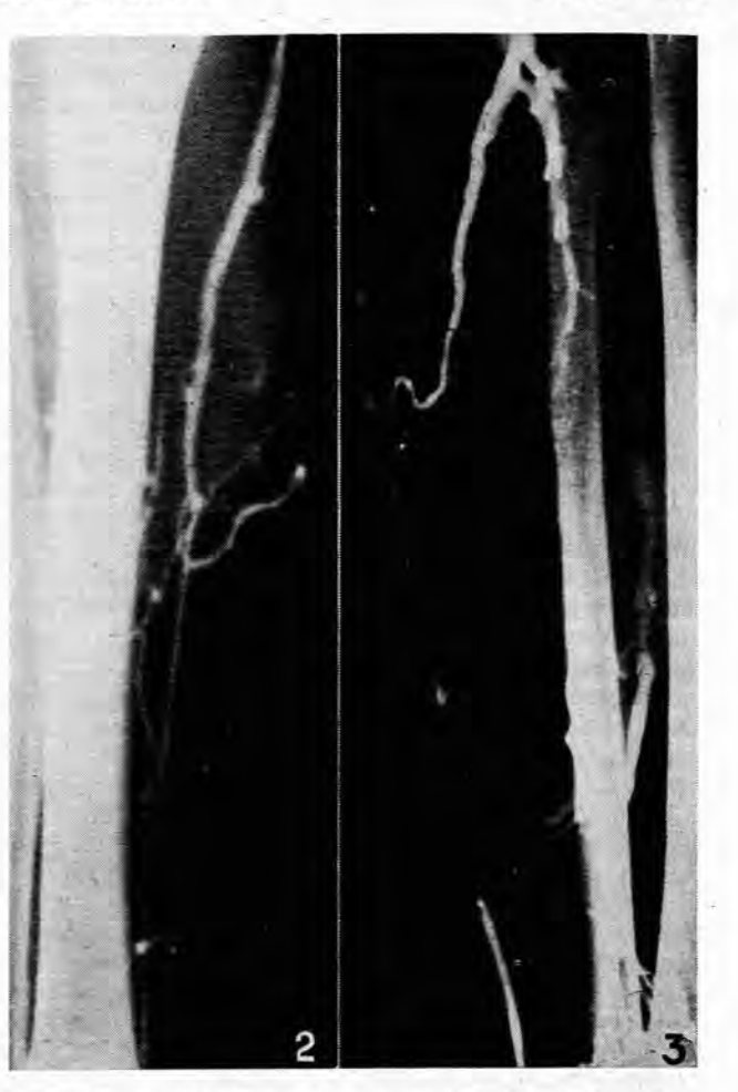
Fig. 2. Long saphenous tree as seen on injection of the vein at the medial malleolus.

Fig. 1. Injection of radio-opaque dye into the small saphenous vein behind the lateral malleolus, demonstrating intramuscular lakes and intermuscular veins.