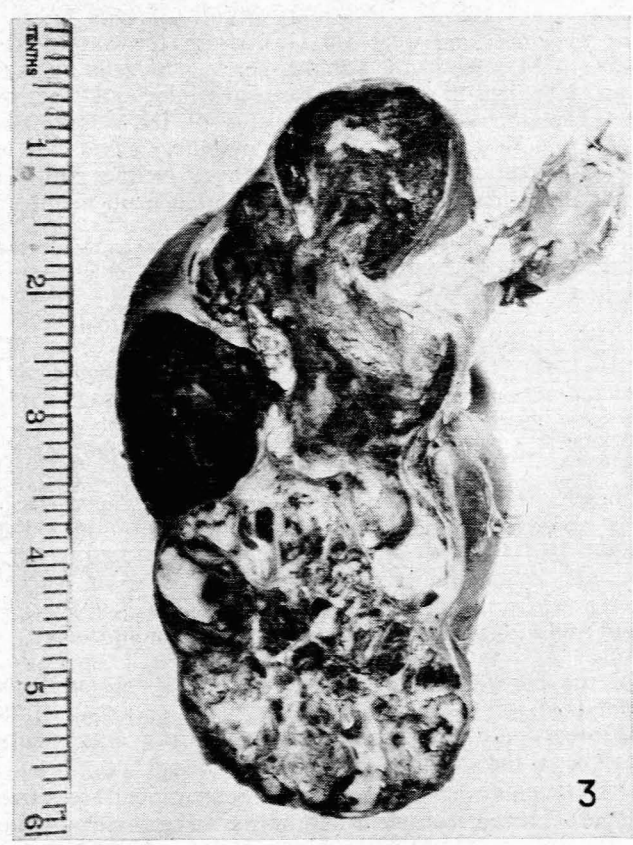
Fig. 3. The tumour after removal.

The patient made an uninterrupted recovery, and after a course of post-operative X-ray therapy returned home in good health. Apart from one or two minor setbacks, in one case due to measles, and in another to a bicycle accident, she remained well and lively for 3 years. It was then found that she was failing to gain weight, and in September 1951 a lump was detected in the left side of the upper abdomen. The left kidney was hydronephrotic and was displaced by the mass. The diagnosis of glandular metastases was made and further irradiation was given. Deterioration in the child's health continued and she died on 12 March 1952, 3 years and 7 months after her operation and over 4\frac{1}{2} years after the onset of symptoms. Consent for a post-mortem examination was not obtained.