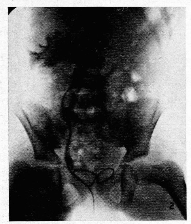
Fig. 2. Retrograde pyelogram.