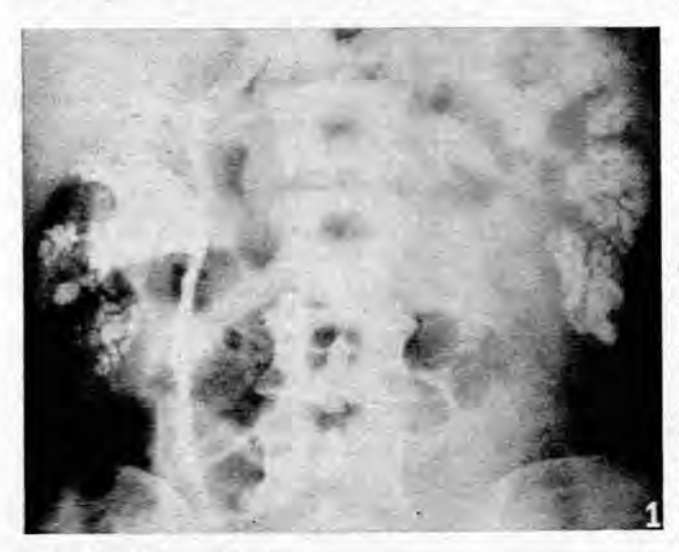
Fig. 1. Nephrocalcinosis.

1. Serum Calcium. The presence of a raised serum calcium is the most important single finding. Several estimations should be carried out at intervals, and repeated over a long period if necessary once the condition is suspected. The readings should be consistent and high figures present no difficulty in diagnosis. Ideally the same biochemist should carry out the estimations and his standard top normal figure should be well established if small rises are also to become of diagnostic value. The serum protein should be estimated simultaneously, since if it is low the serum calcium reading may be normal or low and may conceal an elevated ionic