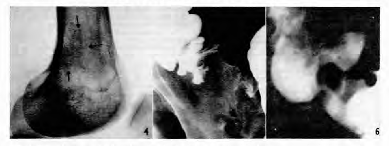
Fig. 4. Vague sclerotic area, right lower femur (case 7). Fig. 5. Irregular filling defect in the caecum, and polyp in the terminal ileum (case 9). Fig. 6. Carcinoid tumour in the base of the duodenum (case 11).

Eventually the patient was persuaded to undergo laparotomy (Prof. C. F. M. Saint, 20 June 1941). Free fluid was found in the abdomen. A large tumour involved the whole of the ascending colon save for the tip of the caecum. The liver was much enlarged and hard and contained many pearly-white fibrotic-looking areas which were obviously metastases. The omentum and bowel were studded with numerous secondary deposits. The ileum was enlarged, widened and thickened. An ileo-transverse colostomy was made. A biopsy of the infiltrated omentum showed the typical appearance of argentafinoma (Prof. B. J. Ryrie).