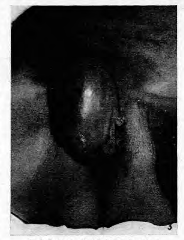
Fig. 3. Tense mass in infralevator haematoma.

The diagnosis is not as a rule difficult provided that the vulval and perineal regions are inspected and a rectal examination performed where indicated. The common reason for missing many of these lesions is that pain in these areas is expected after delivery and therapy is prescribed before ascertaining the cause of the pain. The alert will, however, observe that the pain is often severe, even excruciating. Pain is a prominent feature in larger tumours and is often likened to something tearing. It is not relieved by opiates. The sudden appearance of a tense elastic mass, blue in colour, tender, and encroaching on the vagina in the infralevator variety, is not often missed (Fig. 3). Rectal examination will show a similar mass at a higher level should the supralevator region be affected. A persistent low-grade fever is often present. Shock and anaemia are features found in large haematomata, particularly in those which have extended retro-peritoneally. Anorectal tenesmus