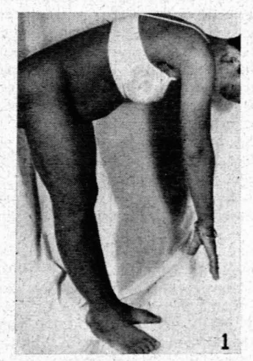
Fig. 1. Showing maximum degree of flexion of spine.

When the patient became ambulant, it was observed that her gait was peculiar, and examination revealed an almost complete