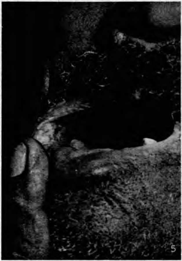
Fig. 5. The same case with lip everted to show the ulceration within

Surgery is indicated in the following conditions: (1) When radiotherapy has failed, (2) when a 'cancer paste' has been used, (3) when glands are invaded and palpable, and (4) when the mandible is involved. The surgery performed is a wedge