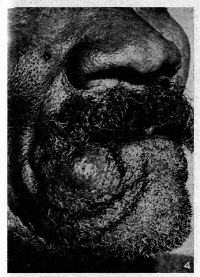
Fig. 4. A typical case in a Coloured male, second variety, showing oedema and swelling as a first sign.

replaces it with fresh mucosa from the unexposed part of the lip. We are indebted to the plastic surgeons who frequently perform this operation for perfecting the technique so that very little deformity is caused. The portion of tissue that has been removed is always examined microscopically, and should carcinoma be found in it, appropriate radiotherapeutic treatment is directed to the lip.