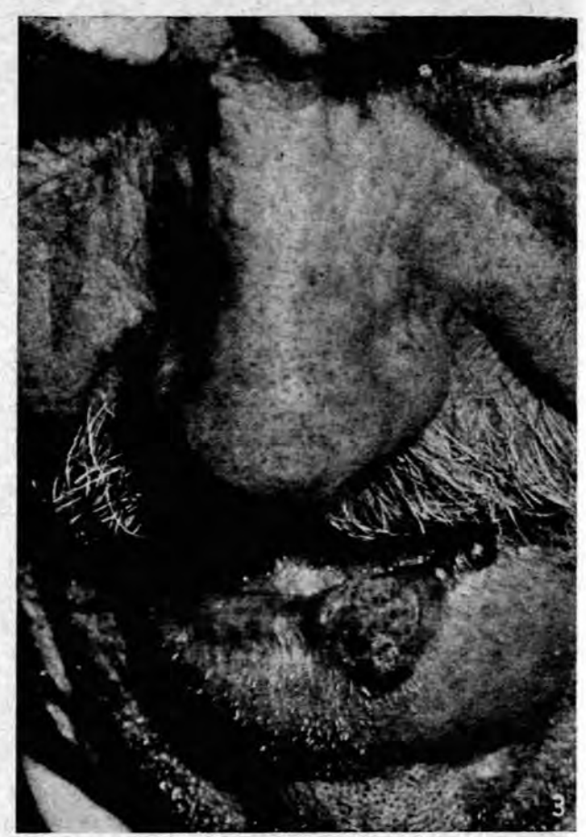
Fig. 3. A similar case. Growth a little larger, prognosis still good.

3. Angular cancer of the lip has long been known to have a sinister significance. We can confirm this from our own experience, but feel that we cannot support the theory, commonly held and taught, that the bad prognosis is due to excessive mobility of the lip at the angles of the mouth, with a qetter-than-average lymph drainage at that part, which causes cancer cells to be massaged into the lymphatic circulation at an early stage. There is no reason why the lymphatic drainage from the angle of the mouth should be any better than that from the lip itself; indeed this has never been proved. If the lymphatic parallels the blood supply, the lymph supply at the angles is indeed very rich, but is no richer than elsewhere, nor do the angles of the mouth move any more actively than the lips themselves, a fact that can be easily