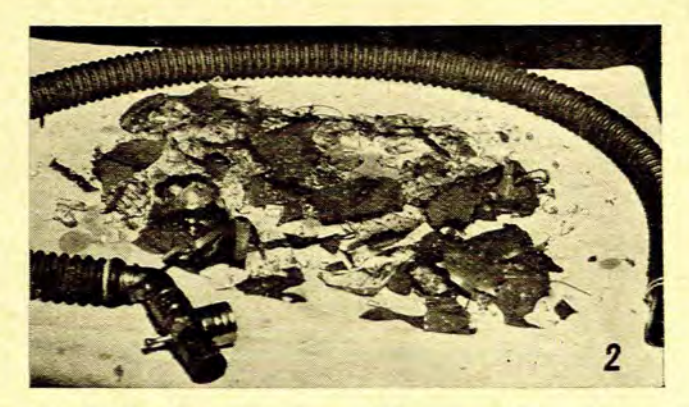
Fig. 2. The shattered remnants of the reservoir bag and the ether and trilene vaporizer bottles. The corrugated rubber tube is undamaged.

moistened gauze. The surgeon unexpectedly announced that he would need to use the electric cautery; so the anaesthetist turned off the ether vapourizer but did not remove the vapourizer from the anaesthetic machine. After waiting for 3 minutes he announced that the cautery could now be safely used. As the surgeon began to cauterize within the mouth there was sharp explosion and the operating theatre was filled with flying glass and with flaming liquid ether from the shattered ether vapourizer. The corrugated rubber tubing was torn from its connections to the endotracheal tube and the anaesthetic machine and was hurled across the room. The reservoir gas bag was fragmented but the corrugated rubber tubing was undamaged (see Figs. 1 and 2). The patient was unharmed and so were surgeon and anaesthetist. The fire was rapidly extinguished (it is always a wise precaution to acquaint oneself with the siting of fire extinguishers in the places where