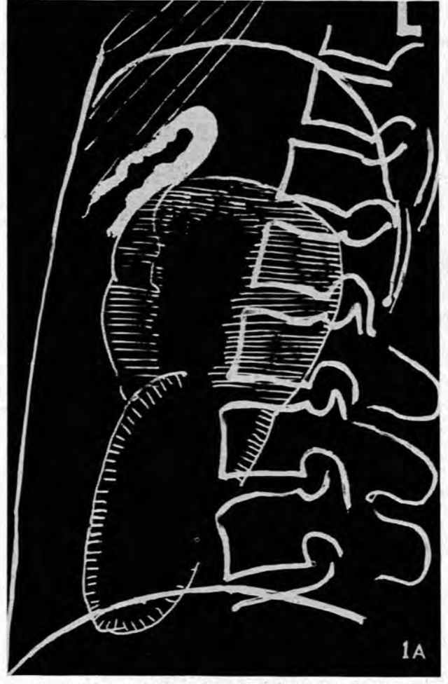
Fig. 1A. Line drawing of Fig. 1 showing the relative positions of tumour, left kidney and stomach.

Progress. During the months after operation there was a sustained improvement: at the end of the 4th month the abnormal bodily and facial hair, the acne and the 'moon face', had completely disappeared. The menstrual cycle was re-established. Steroid excretion was now normal.