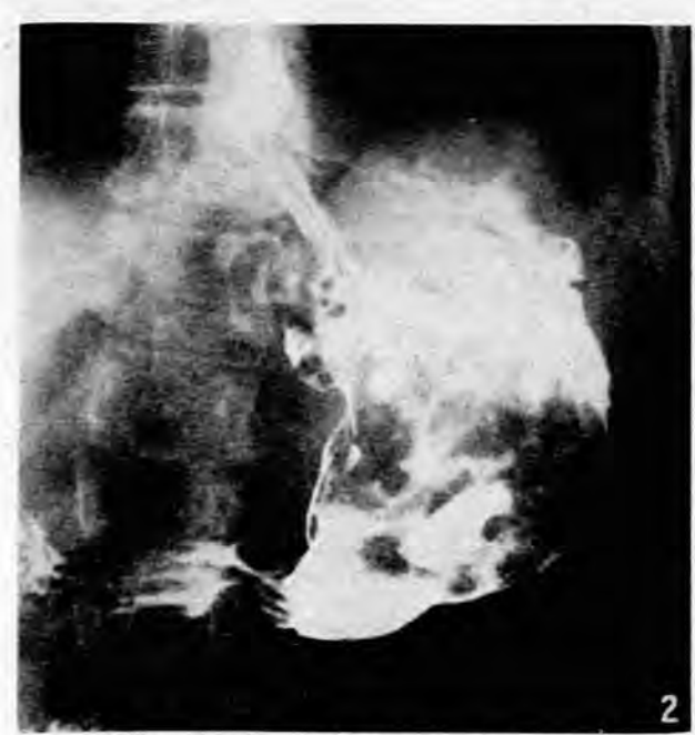
Fig. 2. X-ray of a leiomyoma of the stomach.

Mallory-Weiss syndrome<sup>5</sup> in which the gastro-oesophageal mucosa sustains a fissured tear from the effort of vomiting.