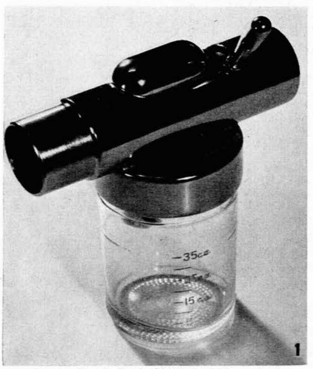
Fig. 1. Rowbotham's vaporizer.

Originally designed for use with chloroform, this vaporizer has been used to administer 'trilene', ether, occasionally 'vinesthene', and now halothane. The original