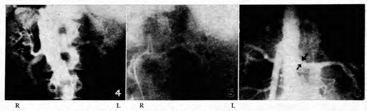
Fig. 4. Hypertensive aorta with inadequate filling of left renal artery.

Fig. 2. Same patient as in Fig 1. Arterial phase. Incomplete ramification of vessels to lower pole of right kidney. Fig. 3. Negative defect of lower pole of right kidney in nephrographic phase. (Segmental resection with return of blood pressure to normal.)