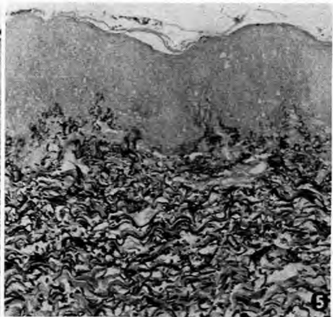
Fig. 5. Case 4. Apparent increase of elastic fibres. No elastosis (Weigert - Halmi green \times 170).