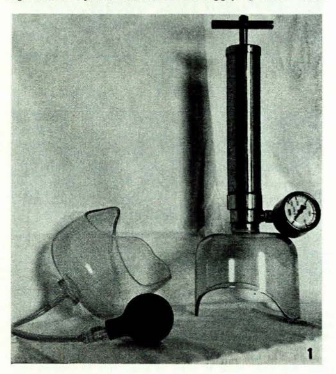
Fig. 1. Two models of 'Gasyd' were used in the investigations. In the one a rubber bulb constitutes the pump. In the other a stainless cylindrical pump, fitted with a vacuum gauge was used. Both were fitted with non-return valves.

small hole within easy reach of the operator. The hole was kept closed by the thumb of the applying hand when