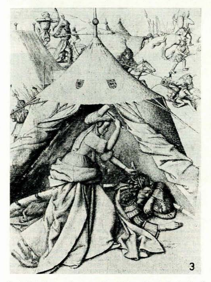
Fig. 3. Jael drives a spike, apparently a tent-peg, through the temples of the sleeping Sisera. From drawing after the Master of Flémalle (about 1430).

that the youth was probably unconscious. 'On the Saturday night, in our assembly for the breaking of bread, Paul, who was to leave the next day, addressed them, and went on speaking until midnight. Now there were many lamps in the upper room where we were assembled; and the youth named Eutychus, who was sitting on the windowledge, grew more and more sleepy as Paul went on talking. At last he was completely overcome by sleep, fell from the third floor to the ground, and was picked up for dead. Paul went down, threw himself upon him, seizing him in his arms, and said to them, "Stop this commotion: there is still life in him". He then went upstairs, broke bread and ate, and after much conversation, which lasted until dawn, he departed. And they took the boy away alive and were immensely comforted' (Acts: 20, v. 7-12).