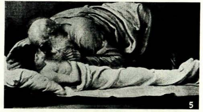
Fig. 5. Elisha and the Shunamite's son by Lord Leighton. The boy is 'dead' probably as a result of cerebral vascular accident (see text) and Elisha is engaged in mouth-to-mouth resuscitation.

'Behold, the hand of the Lord is upon thy cattle which is in the field, upon the horses, upon the asses, upon the camels, upon the oxen, and upon the sheep: there shall be a very grievous murrain' ( Exodus : 9, v. 3).