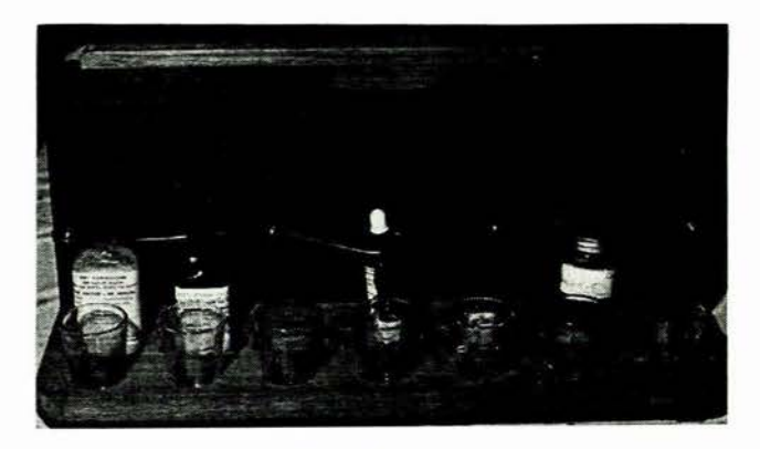
Fig. 1. See text.

It consists essentially of a tray bisected by a vertical partition. On either side of the partition, as shown in the accompanying illustrations (Fig. 1), are tapered slots and circular cut-outs, ½-inch deep, to hold the medicine