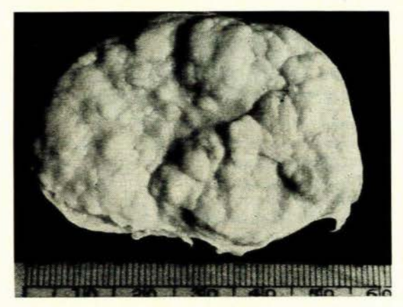
Fig. 4. Macroscopic appearance of ovarian tumour, cut surface showing lobulated appearance and rim of normal ovarian tissue.

The abdomen was entered through a transverse lower abdominal incision. A large well-encapsulated left-sided ovarian tumour measuring 7\frac{1}{2} \times 6 \times 4 cm. approximately was