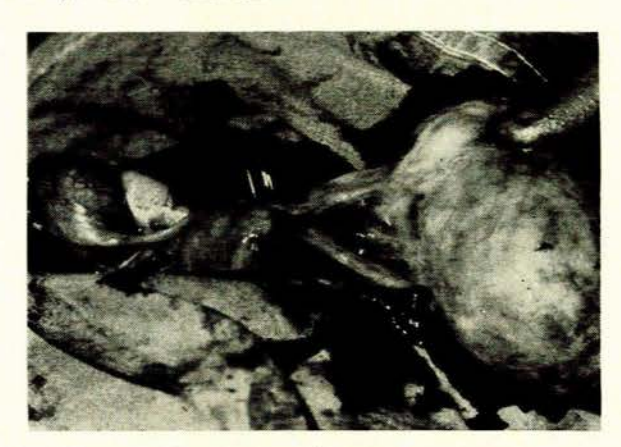
Fig. 3. Large ovarian tumour on left, well-developed uterus and rightsided broad ligament cyst are shown at operation

Operation. Laparotomy was carried out on 23 September 1963 by Mr. J. Wolfowitz.