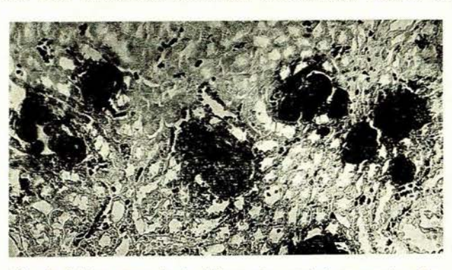
Fig. 3. Calcium stones in the kidney of a rat fed on a maize diet supplemented with cooked soya meal, food yeast, balanced mineral mixture and vitamins A, E and D at the levels employed by Gilbert and Gillman, for 200 days. The section was stained with alizarin. The incidence of nephrocalcinosis in rats under the above conditions is from 70 to 100%.

Gilbert and Gillman<sup>2</sup> have shown that the addition to maize meal of a particular mixture of foods, which would be considered a 'good' supplement even by experts, causes nephrocalcinosis in rats. We have confirmed these findings, obtaining calcium stones of the type shown in Fig. 3.