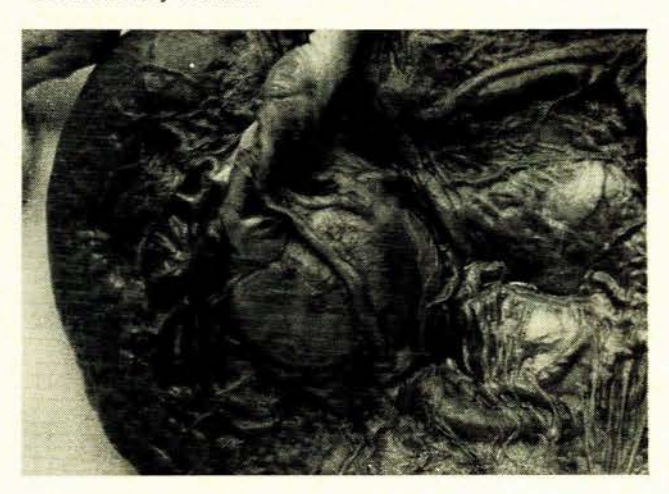
Fig. 1. Foetal surface of the placenta showing the haemangioma adjacent to and involving the umbilical cord.

Postpartum and neonatal periods for both mother and child were absolutely normal.