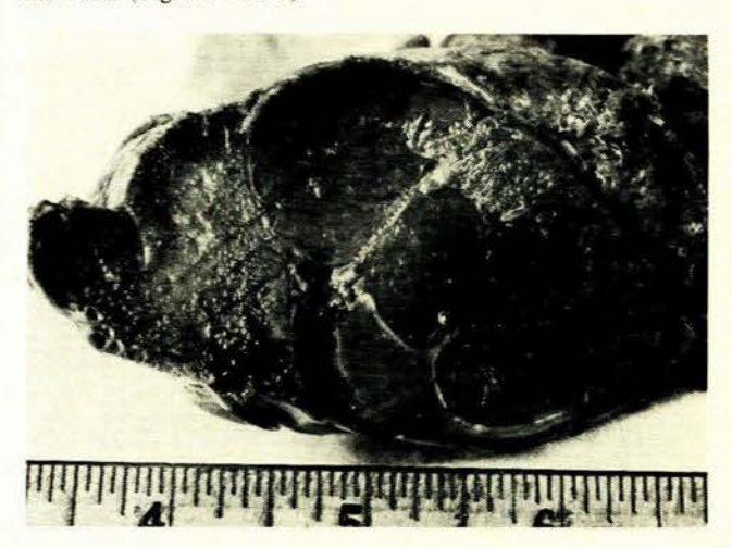
Fig. 3. Cross-section of haemangioma.

The placenta followed normally, and on the foetal surface there was a large swelling which occupied the area from the edge of the placenta to within 1-1½ inches of the insertion of the cord (Figs. 2 and 3).