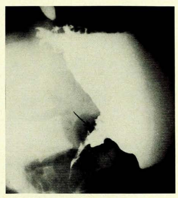
Fig. 2. Barium meal of case 1, showing appearances suggestive of carcinoma.

Operative findings. After a right paramedian incision ascites was encountered within the peritoneal cavity, and numerous caseous lesions were found on the stomach wall anteriorly, with enlarged lymph nodes. Inflammatory tissue was found in the antral region. A gastro-enterostomy was performed and a number of lymph nodes were excised for histology.