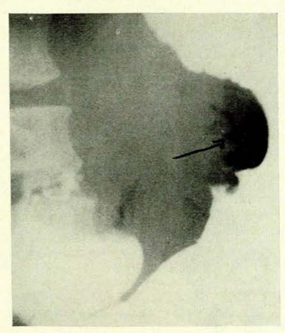
Fig. 3. Barium meal of case 2.

There was a soft-tissue mass in this region, which could have been a large abscess or a collection of inflammatory tissue.