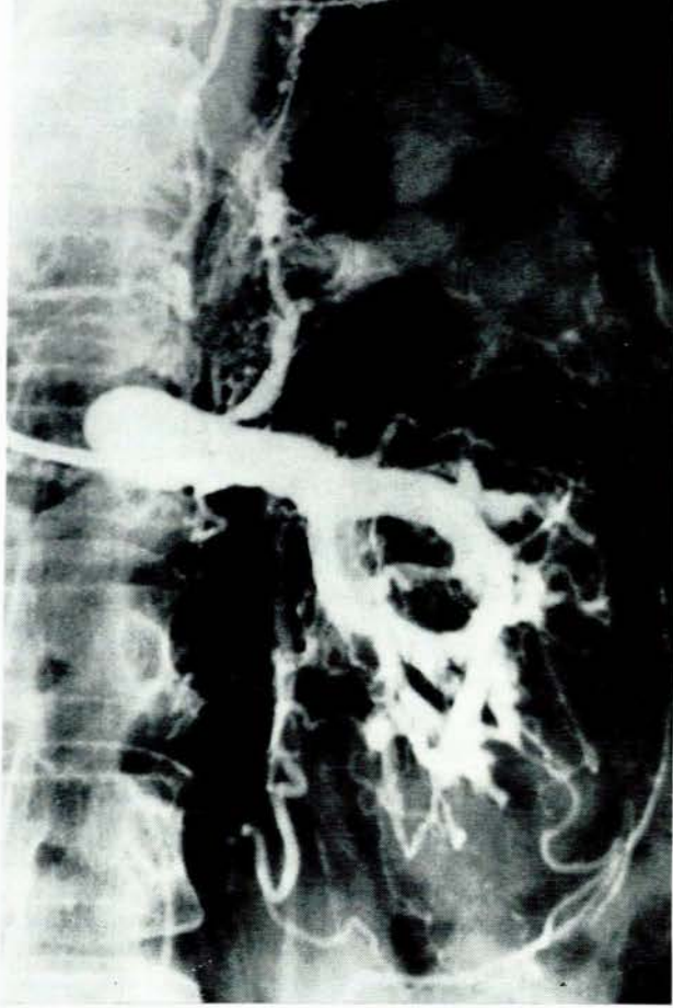
Fig. 4. Left renal phlebogram showing the suprarenal vein, its distribution branches to the gland and the collateral circulation pattern linking it to diaphragmatic veins. A hypernephroma cuts off the renal vein's upper lobal branch.

It is thus possible to obtain an outline of the normal venous pattern of the kidneys and to identify the most significant aspects of this particular area, as represented by vascular