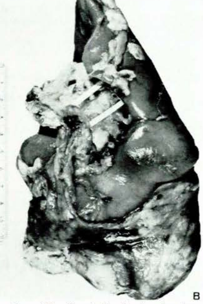
Fig. 2B. Surgical check showing malignant lump in the lower two-thirds of the kidney. The 2 arrows indicate the kidney's vascular hilum.

and will show the progress of a possible malignant offspring in the vasal lumen or the involvement, if any, of the cava from outside.