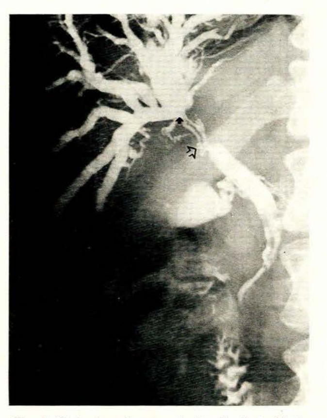
Fig. 3. Cholangiocarcinoma main hepatic ducts (black arrow) with moderate intrahepatic biliary dilatation with incomplete obstruction and filling of the distal common bile duct and gall bladder. The lymphatics draining to glands in the porta hepatis have filled from interstitial injection (white arrow).

The cause of jaundice in the 7 remaining true negative cases with non-surgical jaundice is shown in Table II.