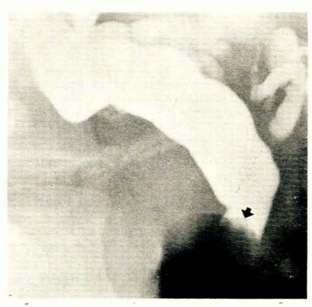
Fig. 4. Common bile duct calculus with a convexity at the site of obstruction (arrow).