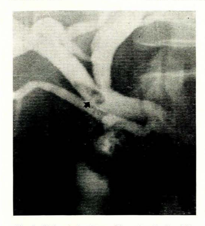
Fig. 5. Cholecystenterostomy with a stone in the right hepatic duct (black arrow) causing recurrent cholangitis. There is drainage into the gall bladder (white arrow).