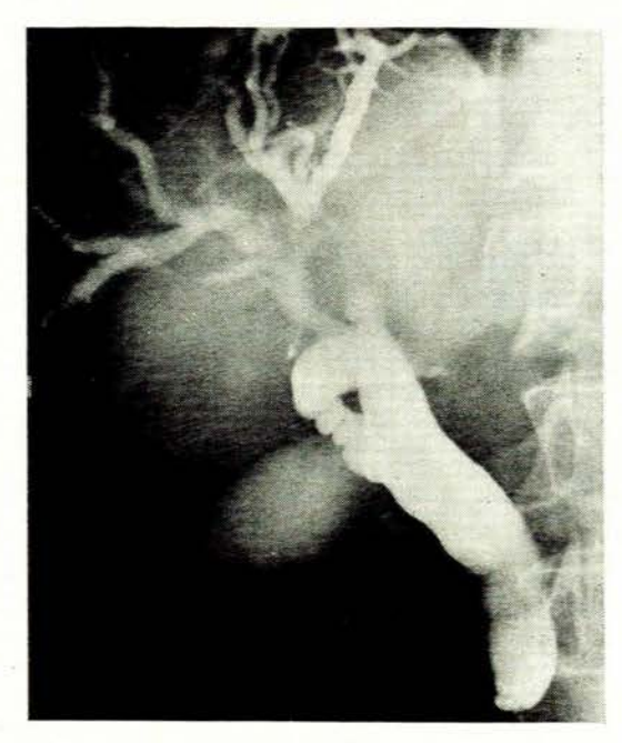
Fig. 1. Carcinoma of the head of the pancreas with occlusion of the distal common and cystic bile ducts and gross dilatation of the intrahepatic biliary tree.

Where the punctures were successful the ducts were invariably entered during the first two attempts out of a maximum of four.