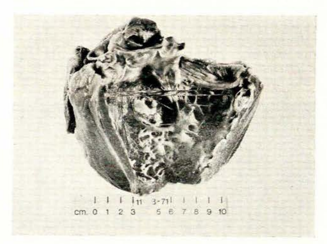
Fig. 7. Additional case 5. Multiple plaques of endocardial fibrosis in the left ventricle. The appearance is unlike that of endomyocardial fibrosis of the Davies type.

Case 5. This 61-year-old White male developed cardiac failure of acute onset. The cardiac failure became so severe and unresponsive to therapy that 2 years after the first onset of symptoms cardiac transplantation was performed as a last resort. The patient died of cardiac rejection and bronchopneumonia 13 days after transplantation. The patient's original heart (removed at the time of transplantation) weighed 580 g. There was no sign of infarction and the myocardium appeared translucent, with some mottling. The coronary arteries were remarkably free of atheroma. All four cardiac chambers were dilated and hypertrophied. The left ventricular endocardium bore multiple pearly-white plaques of fibrous tissue having the appearance of organised thrombi (Fig. 7). The distribution was unlike that of endomyocardial fibrosis of the Davies type. No fresh antemortem thrombi were seen and the heart valves were normal.