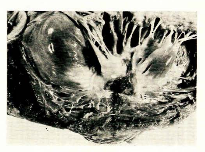
Fig. 3. Case 2. Endomyocardial fibrosis of left ventricle with apposition of papillary muscles and unorganised surface thrombus.

At autopsy, apart from bilateral bronchopneumonia, the pathological findings of note were confined to the heart, which weighed 675 g. All four cardiac chambers were dilated and hypertrophied. The coronary arteries had minimal atheroma. Towards the apex of the left ventricle the endocardium was thickened by dense fibrous tissue, contraction of which had drawn the bases of the papillary muscles into apposition (Fig. 3). A thin layer of thrombus was present on the surface. The fibrous layer enveloped the small anterolateral papillary muscle. The remainder of the left ventricular endocardium, including that behind the posterior mitral leaflet, was normal. While some mitral chordae were slightly thickened, all appeared freely mobile and were not adherent to endocardium at any site. Two small areas of endocardial thickening (the larger 2 cm in diameter) were present in the right ventricle, one on the anterior wall and the other on the septum.