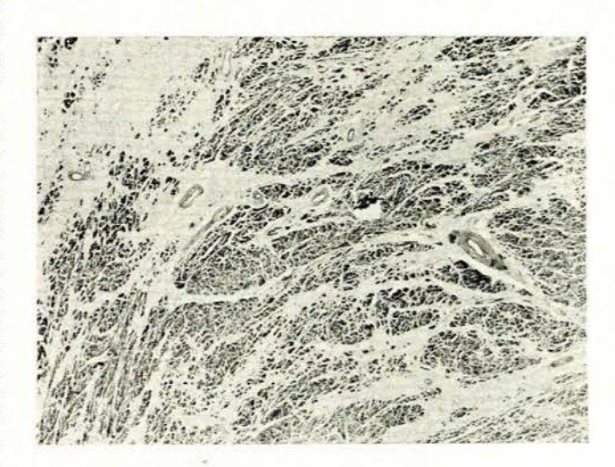
Fig. 5. Case 3. Section of left ventricular myocardium showing severe degree of diffuse fibrosis (H. and E. \times 96).

throughout all the sections examined. Some myofibres were hypertrophied whereas others looked atrophic. There were no acute myocardial changes. Several of the intramyocardial arteries had thick walls due to intimal fibrosis and medial hypertrophy. Other autopsy findings included cardiac cirrhosis of the liver, fibrous thickening of the splenic capsule and a massive right-sided cerebral haemorrhage. The cardiac changes were those of endomyocardial fibrosis of the Davies type.