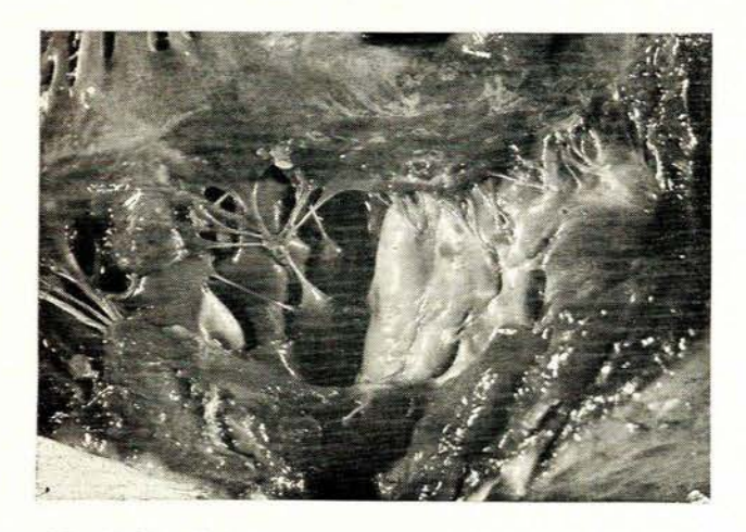
Fig. 4. Case 3. Endocardial thickening on the septal wall of the right ventricle, with adherent tricuspid valve chordae. A small patch of endocardial sclerosis is also present on the free wall.

Microscopically the endocardial lesions consisted of dense collagenous tissue with scanty elastin. The myocardium showed an extraordinary degree of fibrosis (Fig. 5)