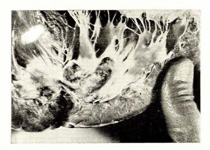
Fig. 6. Additional case 4. Endomyocardial fibrosis in a patient with a coexistent aortic valve lesion. Such cases tend to be ignored in studies of idiopathic cardiomyopathy.

Histology showed scattered areas of fibrosis in the left ventricle, much less severe than that seen in case 3. The endocardial plaque in the left ventricle consisted of