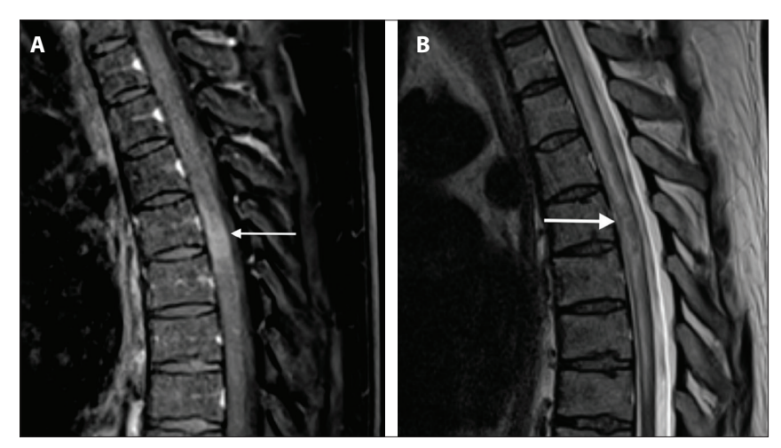
Fig. 1. Magnetic resonance imaging of the spinal cord on admission. (A) Focus of signal alteration in the mid-thoracic cord on the T2-weighted image (arrow), with surrounding oedema. (B) Post-contrast enhancement on T1-weighted imaging after gadolinium administration (arrow).