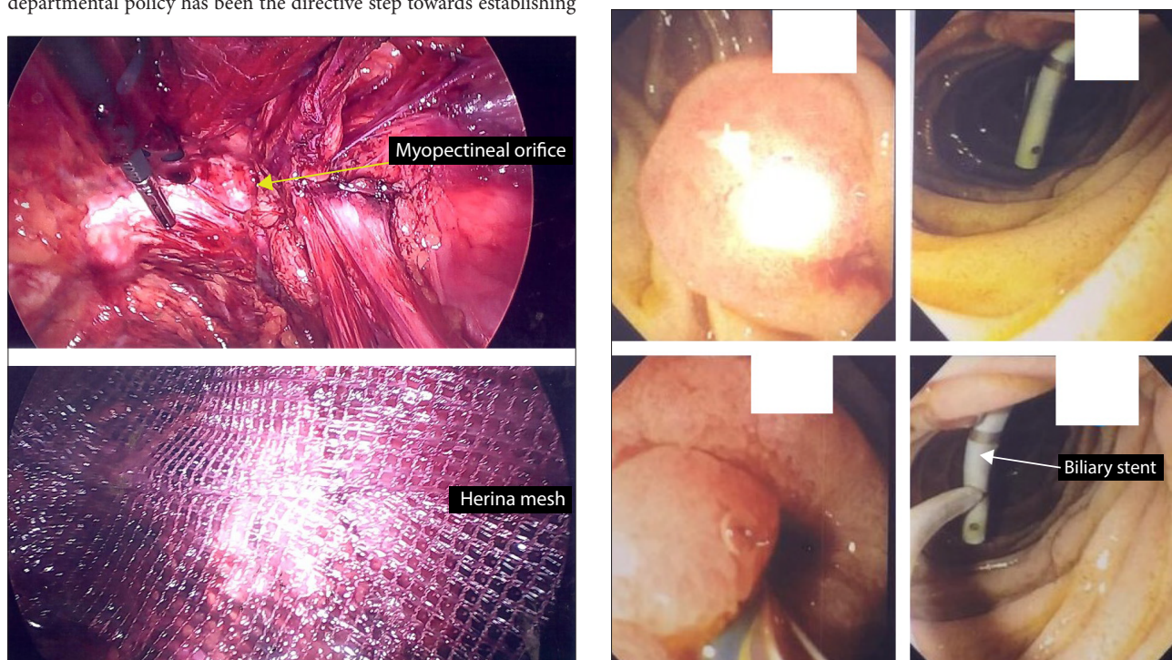
Fig. 2. Laparoscopic view of totally extraperitoneal inguinal hernia repair.

Health practitioners play a major role as the key target for initiatives to improve efficiency in healthcare. They are responsible for the allocation of a large proportion of healthcare resources. It has been reported that there are immense variations in costs and uses of resources between healthcare providers, highlighting the importance of a 'reconfiguration of services' in which organisational weaknesses are identified and skills are transferred from efficient service providers.<sup>[7]</sup>