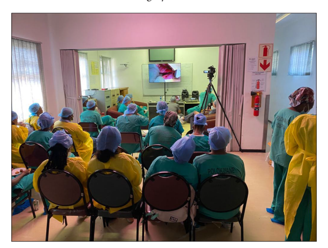
Fig. 1. Laparoscopic hernia workshop in progress.

High-tech procedures in the Limpopo Academic Complex comprise three areas: vascular surgery, laparoscopic surgery and interventional endoscopy. We intend to report on high-tech vascular procedures in a future article on vascular surgery.