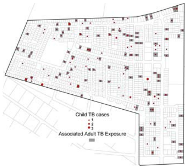
Fig. 1. Distribution of childhood TB cases and of notified adult TB cases from 1997 to 2007 in the community.

Overall 113 (66%) of the childhood TB patients had one or more exposures to a notified adult TB case on their residential plot during their lifetime, with an annual exposure rate of 33%. In 28% of cases a family name was shared with one of the adults notified on the plot. In total 105 children (61%) were exposed to adult PTB cases, 91 being exposed to a mean of 1.9 smear-positive PTB cases and 40 to smear-negative PTB cases (53% of all child TB cases v. 23%, p < 0.001 ). Fig. 1 shows the distribution of child TB cases and adult TB cases in the community. Children who were exposed to TB cases on their residential plot did not differ from those children not exposed in terms of age ( p = 0.23 ), gender ( p = 0.51 ) or HIV status ( p = 0.76 ). However, childhood TB cases not exposed on their residential plot were more likely to be retreatment TB cases than those exposed on the plot (12% v. 4%, p = 0.03 ).