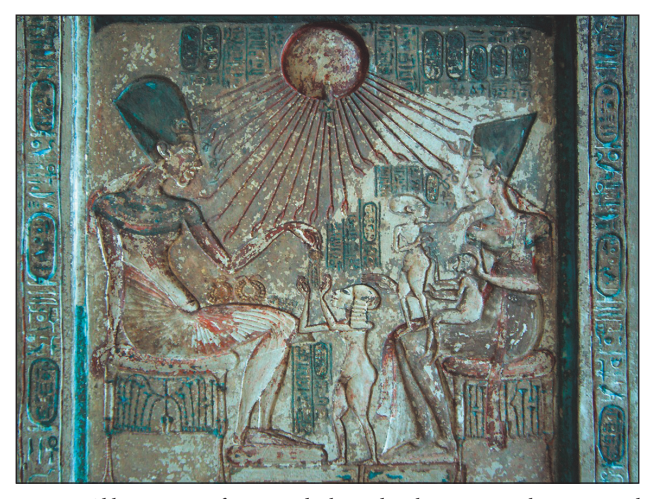
Fig. 1. Akhenaten, Nefertiti and their daughters; note their unusual appearance.

Loeys-Dietz syndrome (LDS) is an autosomal dominant inherited disorder of connective tissue that has been recently introduced as an important cause of familial aortic aneurysm. LDS is caused by heterozygous mutations in genes encoding transforming growth factor \beta receptors 1 and 2 ( TGFBR1 and TGFBR2 ).<sup>5</sup> Patients affected with this syndrome are characterised by specific clinical features