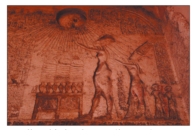
Fig. 3. Akhenaten's family worshipping Aten (the sun image).

Different syndromes and diseases have been hypothesised to explain a probable underlying disease in Akhenaten, Tutankhamun and