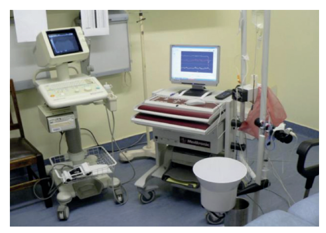
Fig. 2. Dedicated paediatric urodynamic and sonar suite at Red Cross War Memorial Children's Hospital.

overlap, they assist in patient management. Anticholinergic drugs might at best be expected to treat the neurogenic detrusor overactivity associated with types B and D by improving functional capacity and reducing filling pressures. Types A and C usually require clean intermittent catheterisation alone, with marginal benefit expected from anticholinergics.