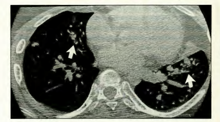
Fig. 2. HRCT scan demonstrating peribronchiolar distribution of nodules with clustering (arrows).

adrenal glands revealed histological evidence of adrenocortical hyperplasia. The postoperative period was complicated by partial septic wound dehiscence from a right peri-ureteric abscess that developed as a result of persistent urine leak from the ureterolithotomy. This required formal retroperitoneal drainage and prolonged ureteric stenting. At present the patient is asymptomatic, on glucocorticoid and mineralocorticoid replacement therapy.