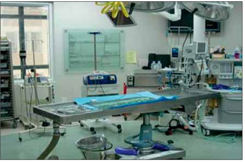
Fig. 3. A modern and well-equipped theatre. Note the specialised operating table and the electrocautery mattress.

We are fortunate to have a dedicated burns theatre with the required facilities for heating, correct anaesthetic equipment, specially designed operating table and appropirate consumables (Fig. 3).