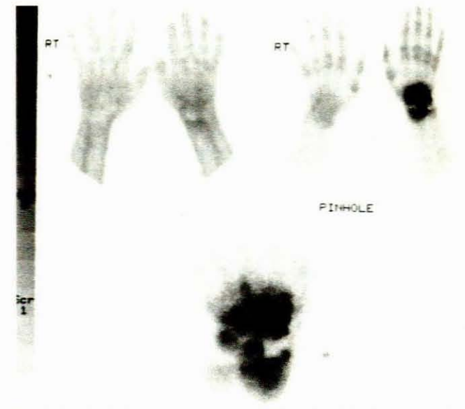
Fig. 3. Scintigram showing multiple foci of uptake in the injured wrist.