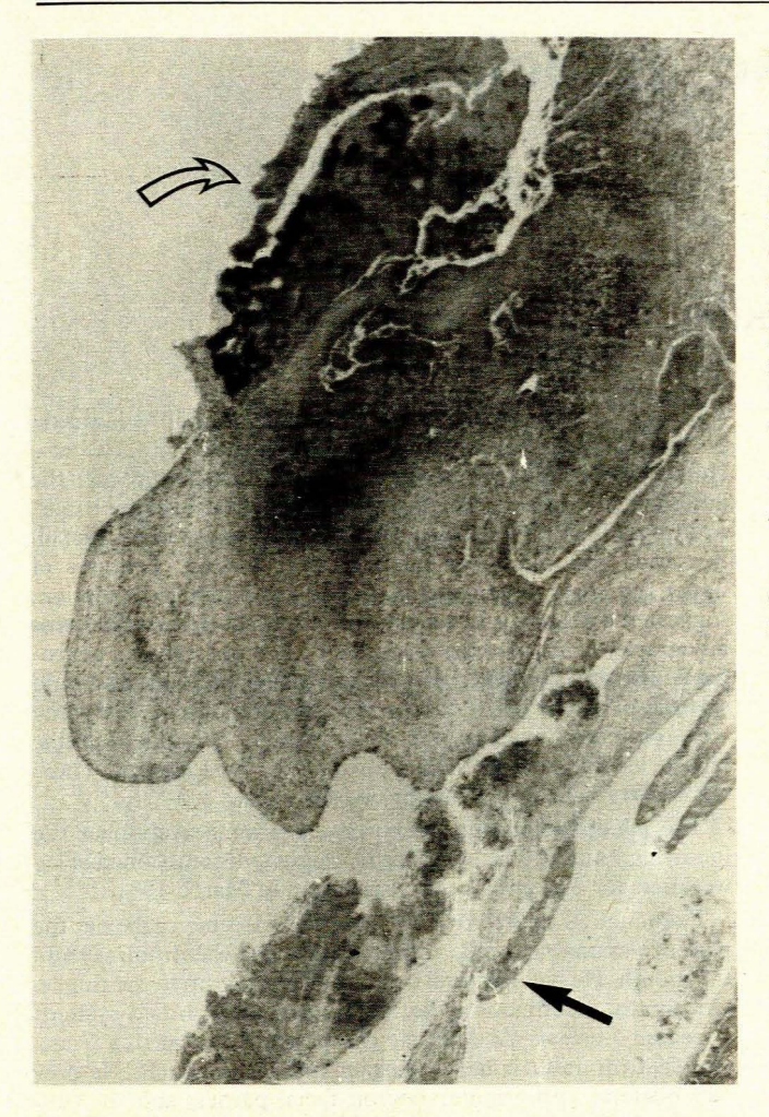
Fig. 3. Exuberant vegetation on the atrial surface of the mitral valve (high-power view) (H and E). Note the cellular infiltrate at the base of the vegetation with dense aggregates of bacilli at the free edge of the vegetation (white curved arrow), and the thin, normal mitral valve leaflet (black arrow).

dency of vegetations to be located on the atrial surface of mitral valve leaflets is not readily apparent.13