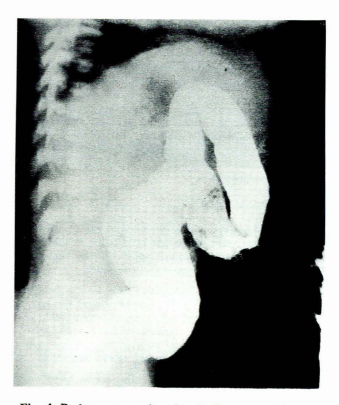
Fig. 4. Barium enema. Anterior displacement of hepatic flexure.

Neonatal adrenal haemorrhage has an autopsy incidence of approximately 1%, usually occurring between the second and seventh days of life. Birth trauma related to difficult delivery and large babies are considered the main predisposing factors. The incidence is higher on the right side (70%) than on the left. An abdominal mass is rarely palpated. It is presumed that the mass palpated in this case represented the anteriorly tilted upper pole of the right kidney. Absorption of the haematoma explains the hyperbilirubinemia.