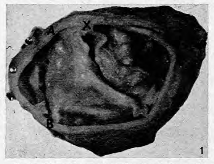
Fig. 1. Post-mortem appearance of aortic valve in case 8. Note the laceration of fused aortic cusps (A B). Normal valve orifice (X Y).

10 and 12) died of ventricular fibrillation on the table. One patient (case 20) died of shock due to persistent uncontrollable loss of blood from his thoracotomy wound, on the day after operation; autopsy did not establish the site of bleeding. Aortic valvotomy appeared to be successful in case 8, but on the day after the operation he developed an attack of acute left ventricular failure with electrocardiographic evidence of an anterior myocardial infarct. The attacks of pulmonary oedema persistently recurred and the patient finally succumbed after 2 weeks. The necropsy revealed an infarcted area of myocardium around the cardiotomy site, but no thrombus was found in the coronary vessels. Furthermore, inspection of the aortic valve showed a large laceration produced by the Brock's dilator, on the periphery of two grossly thickened, distorted, fused aortic cusps (Fig. 1).