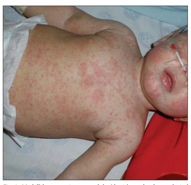
Fig. 2. Morbilliform eruption, part of the 'classic' measles dermatological presentation which included Koplik's spots, other oral manifestations such as stomatitis, conjunctivitis and a history of cephalocaudal spread of the rash.

The collected information was assessed by 7 dermatologists consisting of 1 consultant and 6 registrars. With reference to photographs of typical measles skin reactions, they assessed photographs and limited pertinent information regarding the dermatological presentation of each patient obtained at the initial assessment, and determined whether the patient displayed a morbilliform rash or not (Fig. 2). They also rated each patient according to the degree to which they conformed to the 'classic dermatological measles syndrome'. Concordance with the concept of a 'classic dermatological measles syndrome' was judged subjectively and independently by each of the observers. Observers received information regarding the presence of Koplik's spots, conjunctival manifestations, oral manifestations (stomatitis) and cephalocaudal progression of the rash. The observers were blinded to the patients' serological results. They classified the rash that they saw on photographs as morbilliform or not. They rated the patients as scoring between 0 to 10, with 0 being a patient with no characteristics of 'classic' dermatological measles, and 10 being a textbook case (as described in the introduction of this article). A score of more than 6 out of 10 was taken as a patient profile that could be considered dermatologically typical of measles. The data were analysed using Stata version 11.1 statistical software.