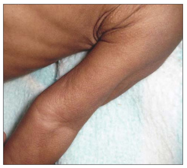
Fig. 4. One study patient with positive measles serology presented with a rash that consisted exclusively of micropapules.

The median age of patients assessed (6.0 months) fits in with the fact that most children contracted the illness before immunisation (usually at 9 and 18 months of age). Incomplete immunity from maternal antibodies may alter the response of infants to disease.<sup>16</sup> That only 2 of the 41 patients who were tested were negative, suggests that the clinical diagnosis of measles was frequently accurate (i.e. the reason for admission). There is a false-negative rate for the