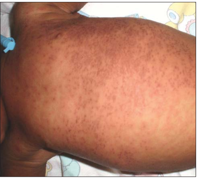
Fig. 5. Study patient with positive serological results displaying skin necrosis.