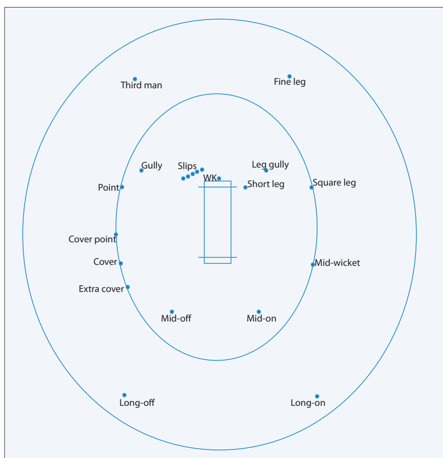
Fig. 2. Pitch map showing the different fielding categories. (WK = wicket keeper.)

and required practically no diving or lateral movements. This finding is not consistent with conventional wisdom.