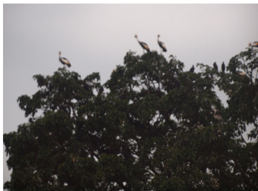
Figure 2. Balearica regulorum roosting on a Milicia excelsa tree located in close proximity to the IUIU main gate. Photograph taken on 8 June 2013 at 18:25.

Sites for feeding, roosting and breeding are the three main requirements of cranes,