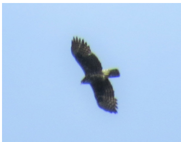
Figure 1. Adult Ayres's Hawk Eagle at Ol Donyo Sabuk National Park, 6 March 2016.

A single adult was seen well by DO on 6 March 2016 and photographed in flight (Fig. 1). The habitat in the National Park appears quite suitable for this forest raptor, yet the absence of other observations suggests it may only be a wanderer to Ol Donyo Sabuk.