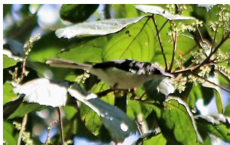
Figure 3. Grey Apalis at Ol Donyo Sabuk National Park, 23 September 2017.

A single bird was seen on 17 September 2017 by SC, DG and BM, and a pair was photographed at 2000m on 23 September 2017 by DG. This species is also mapped as occurring on the mountain by Zimmerman et al. (1996), although the few records suggest it is only a scarce resident at most.