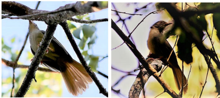
Figure 2a and b. Grey-olive Greenbul at Ol Donyo Sabuk National Park, 23 September 2017.

The liquid and jubilant call of this species was clearly heard from riverine figs at the base of the mountain on 23 September 2017 by DG and BM. Given the presence of numerous fruit trees at this site the omission of this widespread and common species from previous inventories of Ol Donyo Sabuk is surprising.