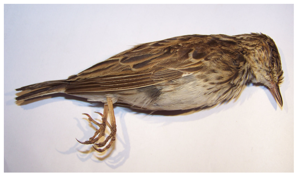
Figure 3. Photograph of Bush Pipit collected at Mpala Research Centre.