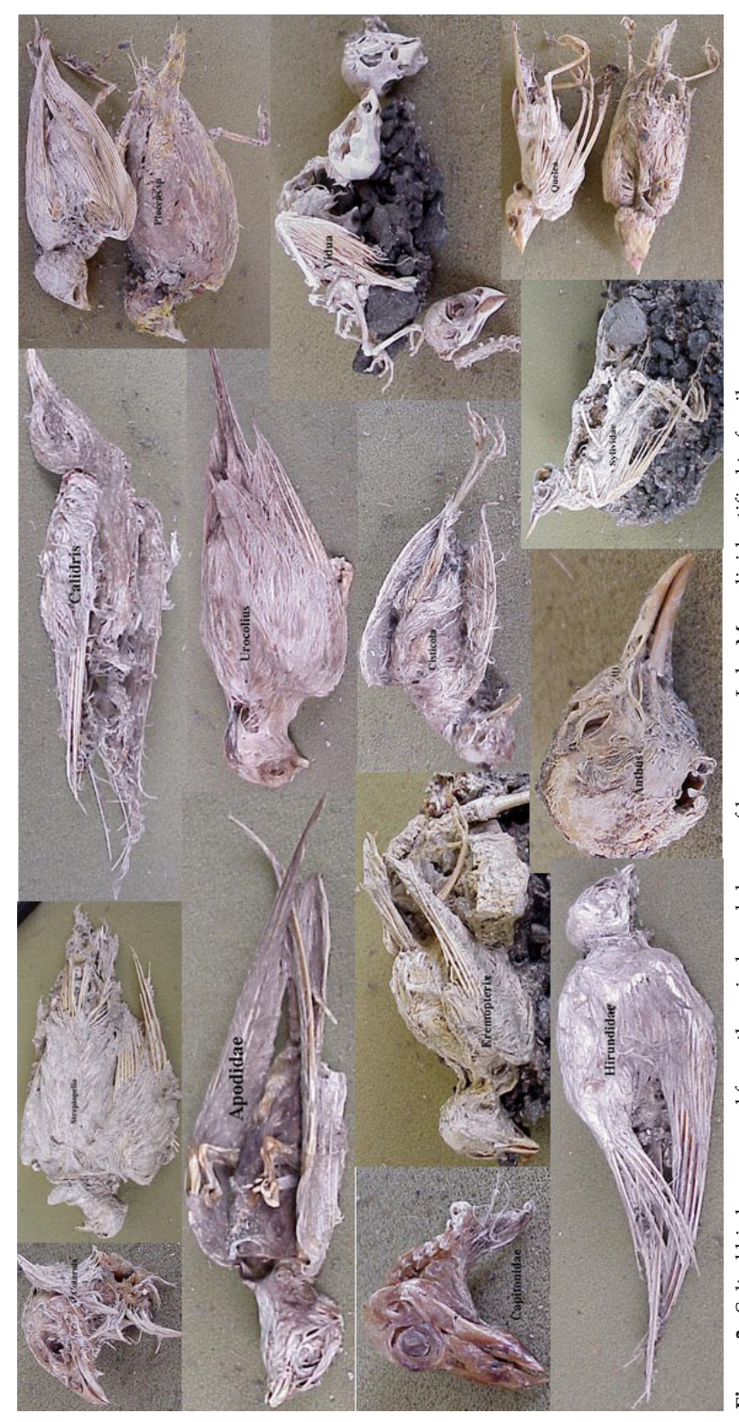
Figure 3. Salted birds recovered from the windward shores of lagoons on Lake Magadi, identified to family or genus.