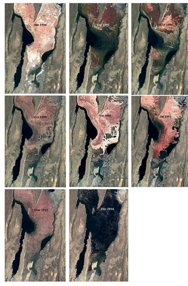
Figure 2. Eight satellite photographs of the southern end of Lake Magadi from Google Earth, spanning the years 1986–2016. These illustrate variations in the expanse of open water, and changes in the shape of the lagoon, the protrusion of the peninsula into this lagoon and how its tip acts as a windward shore upon wind-blown wrack from the east can be trapped. Note that, as in 1986, the tip was sealed off by trona.

Where lake edge spring and seep inflows have temperatures <42^{\circ} C and a pH of c . 9, the shoreline and water support a specialized flora and fauna adapted to these extreme conditions, which host many birds that make Magadi a well-known bird-