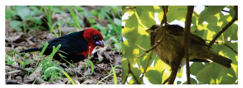
Figure 2. Red-headed Bluebill Spermophaga ruficapilla, Katimok Forest, Tugen Hills, Kenya, 15 Jun 2014.