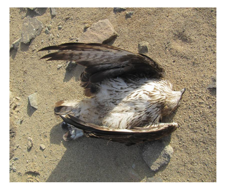
Figure 1. Electrocuted adult Bonelli's Eagle Aquila fasciatus in the Red Sea Hills of Sudan.

On 30 September 2010 in the Red Sea Hills of Sudan, under a powerline near Port Sudan, we found one electrocuted adult Bonelli's Eagle (Fig. 1). The bird had probably died several weeks before we saw it, but its corpse was still well preserved and not eaten by scavengers. Later on the same day, at about 17:40, 10 km west from this site we observed two adult Bonelli's Eagles in suitable breeding habitat. One of the birds was observed for most of the time, mainly soaring on about 100 m above the highest part of the cliffs and on three occasions steeply diving behind them then reappearing and gaining height again. The second adult was observed only briefly, gliding low over the cliffs and hiding behind, whilst the other individual soared about 50 m above it. After inspection of the cliffs with binoculars and a telescope (Swarovski 20–60x60), two very large stick nests were seen in crevices on the high vertical cliffs (Fig. 2). One of them was estimated to be about 100 cm in height and width. Taking into consideration the resident occurrence and highly territorial behaviour of the Bonelli's Eagle (Fergusson-Lees & Christie 2001) and the observation of two adults in close proximity to the nests, breeding of this species in this part of Sudan was probable although we could not entirely confirm this.