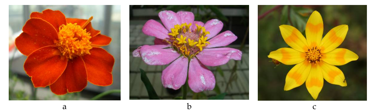
Fig. 2. Inflorescences of the three study species a) Tagetes patula , b) Zinnia elegans and c) Bidens prestinaria.

found all over Ethiopia (Mesfin Tadesse, 2004). The leaves of T. patula are used as a seasoning in central Africa while the dried flowers are sometimes used to adulterate saffron. The whole plant is harvested when in flower and distilled for its essential oils. The oil is used in perfumery and has also a wide range of biological activities (Romagnoli et al. , 2005). The plant grows in full sun and, according to Gilman (1999) is not known to be invasive.